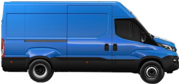
Iveco Daily 35S12V