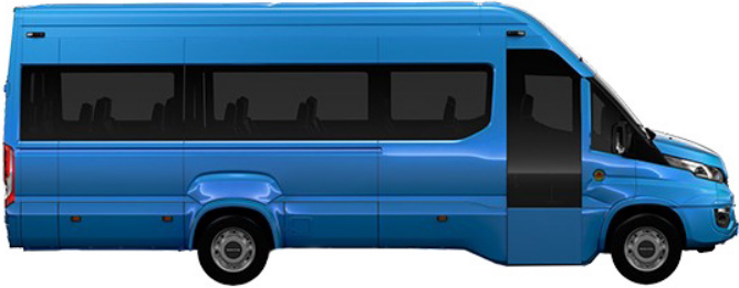
Iveco Daily 56C15