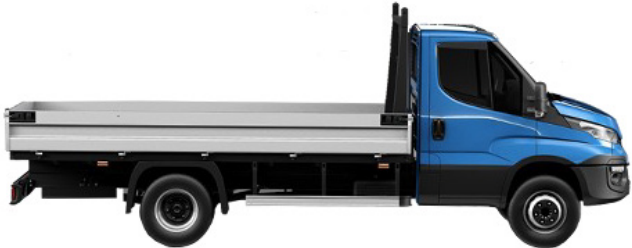
Iveco Daily 35S12