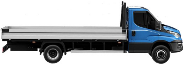
Iveco Daily 70C15